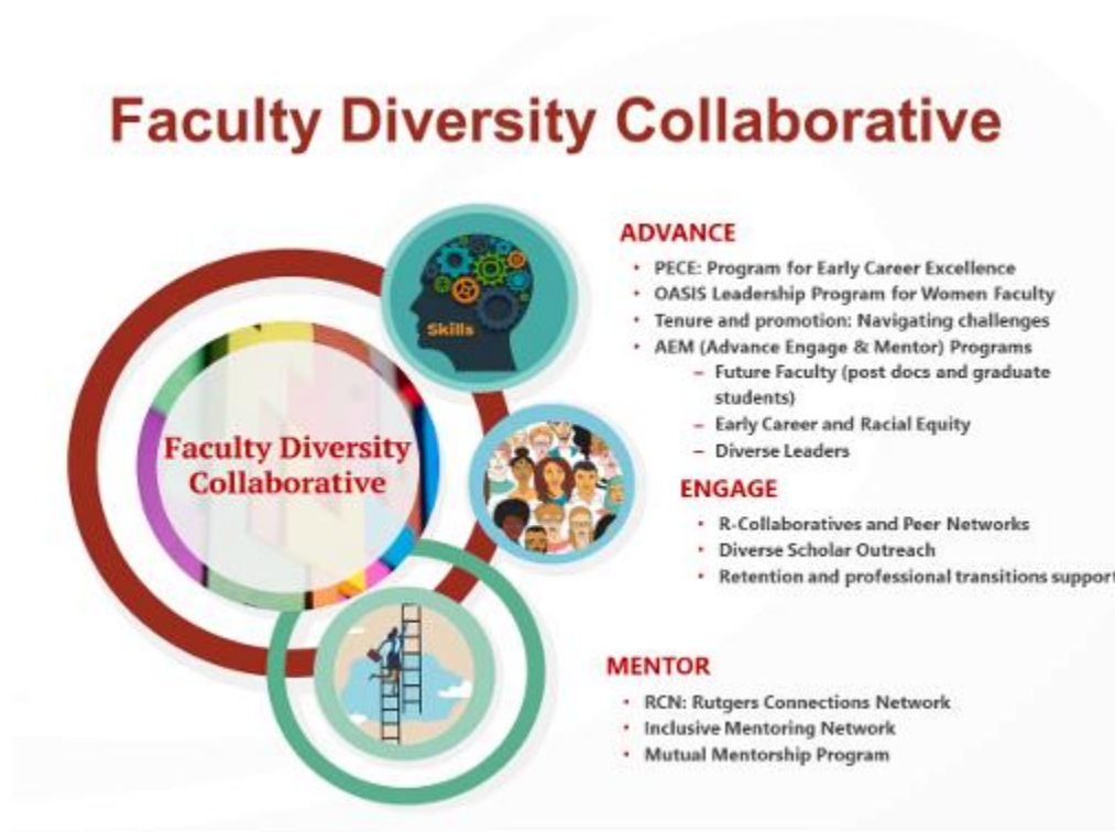
Figure 1. Rutgers Faculty Diversity Collaborative